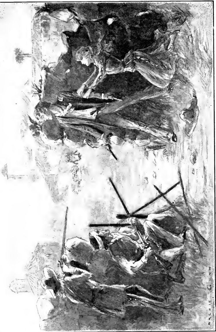
THE DEFENSE OF THE CONVENT WALL